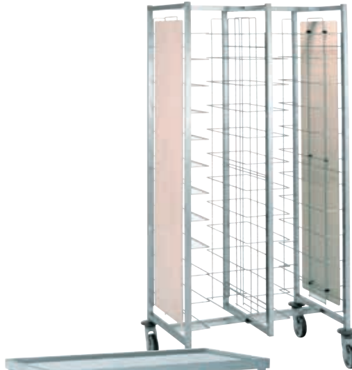
Trolley with 2x12 levels, insertion widthways with two stacks (side by side), with side panels.