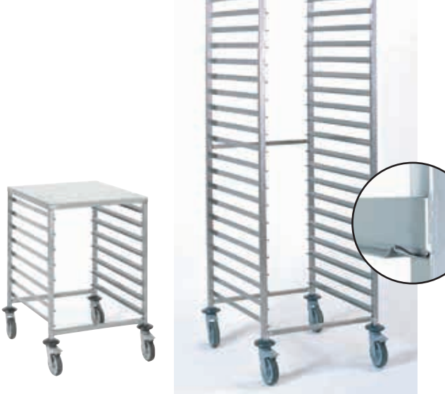
Low trolley with top panel