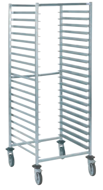
Pastry trolley, 600 mm opening

The slide bars are continuous welded on an automatic welding bench. The weld seam is performed over the whole length of the bar slide without filler metal. This production process ensures even welds. And above all, exceptionnal resistance to wrenching.